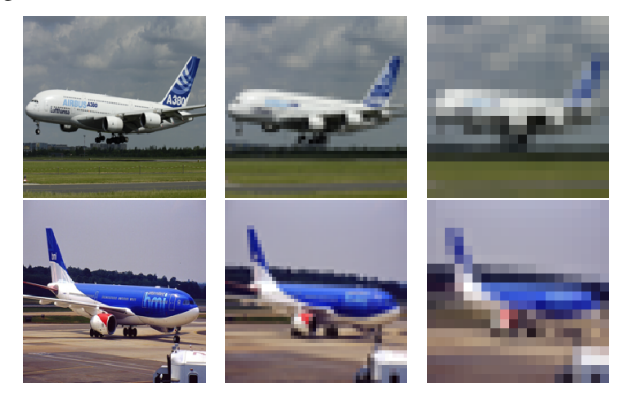
Fig. 4 . Example of two Airbus airplane images (top A380, bottom A330-200) at resolutions 200 \times 200 (left), 50 \times 50 (middle) and 20 \times 20 (right). Resolution degradation occludes the discriminating details that enable distinguishing classes.